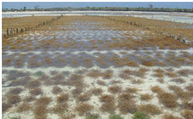
FIGURE 2. Seaweed production systems: bottom culture of red seaweed in intertidal zones in the tropics (left) and floating line culture of brown seaweeds in temperate areas (right).